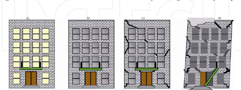
Figure 2. Levels of building performance: (a) operational, (b) immediate occupancy, (c) life-safety, and (d) collapse prevention [30].

In the numerical analyses performed under a described earthquake design, it is specified that the existing system meets the conditions set forth for life safety performance level. For an earthquake with 10% recovery possibility in 50 years, it is determined that the shear strength of all the walls in both directions of the masonry building is ordinarily adequate to