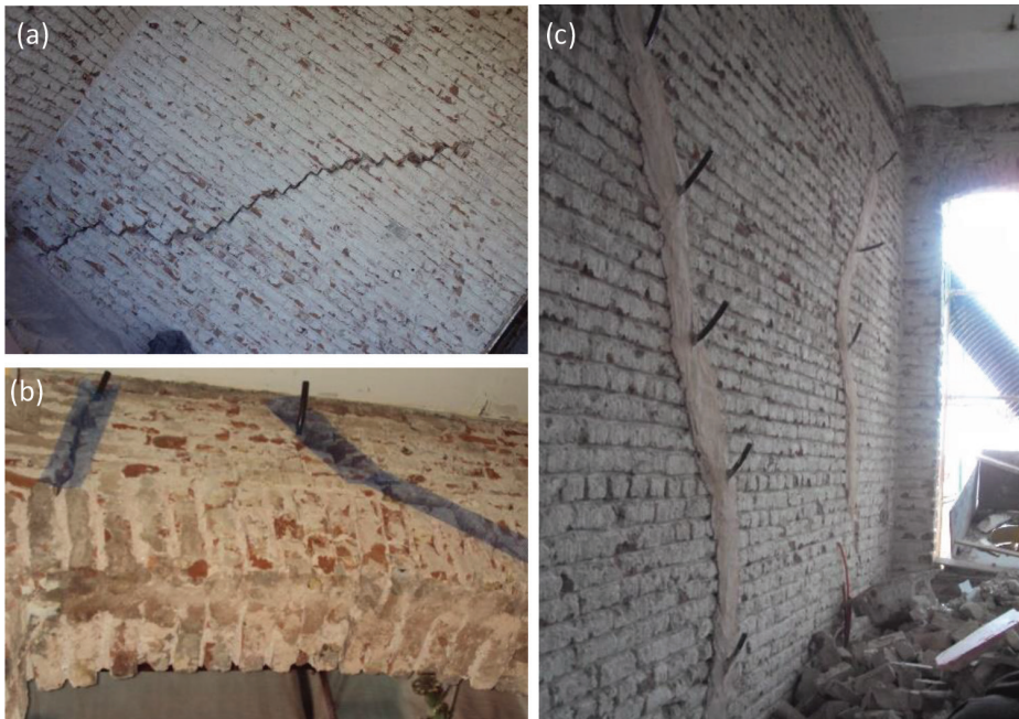
Figure 3. Injection application in the walls after plaster removal: (a) structural cracks, (b) preparation of wall surface for injection, and (c) injection application by manual technique.

Carbon fiber wrap can be used in tensile stress areas on wall members to strength dynamic effects, e.g., earthquake. First, applied carbon fiber locations are specified on the facades. Carbon fiber wrap is positioned between window gaps and storey levels and also disguised under plaster layer. Figure 4 shows possible carbon fiber application in the walls.