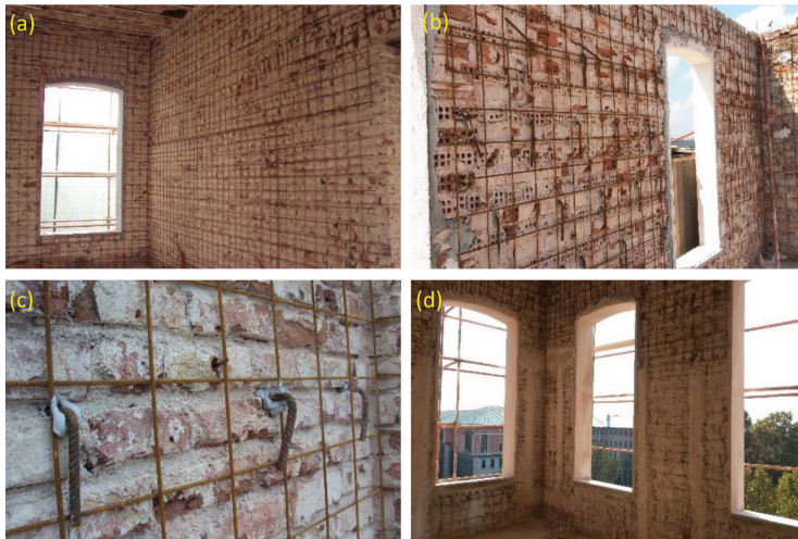
Figure 5. Retrofitting of the internal walls after plaster removal: (a–c) rebar grid technique and (d) application of thick plaster.

After having completed the existing plaster removal from the vertical load-carrying members, internal wall strengthening is applied. In this respect, anchorage holes per square meter are drilled on masonry walls and filled with epoxy ( Figure 5 ).