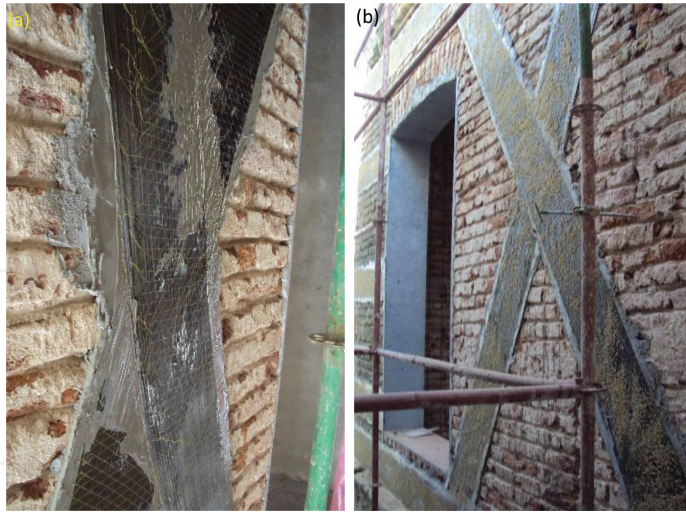
Figure 4. Carbon fiber wrap applications on masonry walls (a and b).