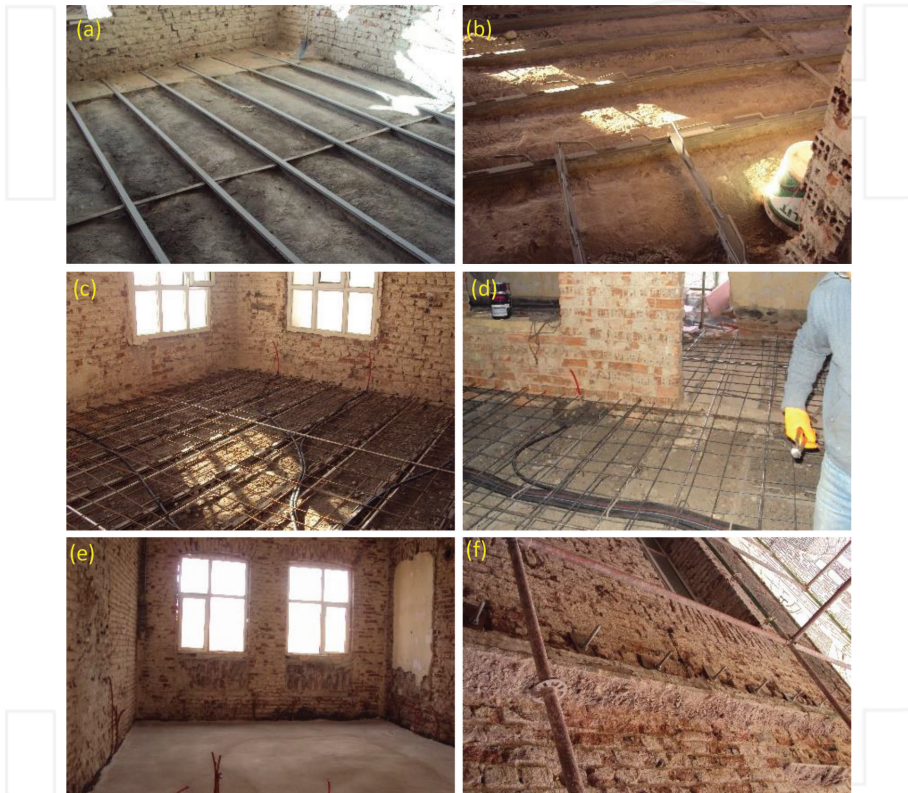
Figure 6. Retrofitting of jack arched slabs: (a) removing top layers of the slab, (b) welding of shear rebar over I-profile beam, (c) steel tie, (d) connections of stainless steel ties between the masonry walls, (e) anchorage of stainless steel, and (f) topping concrete application on slab.

Floor system strengthening consists of two separate parts: (i) Strengthening without removing jack-arched floors, which are positioned on the hallways and assumed as the original ones and (ii) applications of steel beam system installation is applied with the aim of lighting the weight of the building as removing featureless RC additions. Figure 6 presents a similar application about floor strengthening.