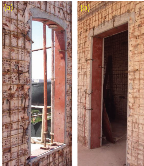
Figure 7. Retrofitting of door and window gaps using steel plates (a and b).