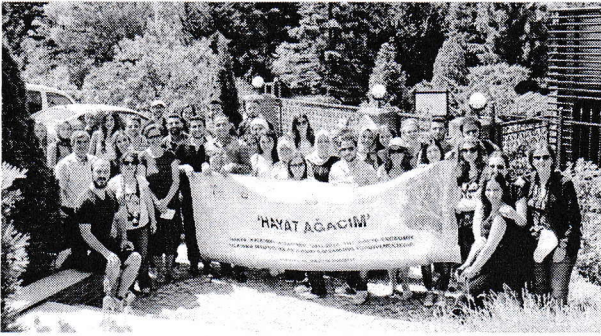
Fig. 1. Trakya University Department of Landscape Architecture Students is Visiting Atatürk Arboretum,

rearing habitat thus this improves consciousness for protection.