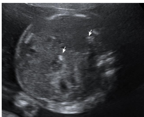
Figure 2. An axial ultrasound plan shows multiple abdominal calcifications at 32 gestational weeks