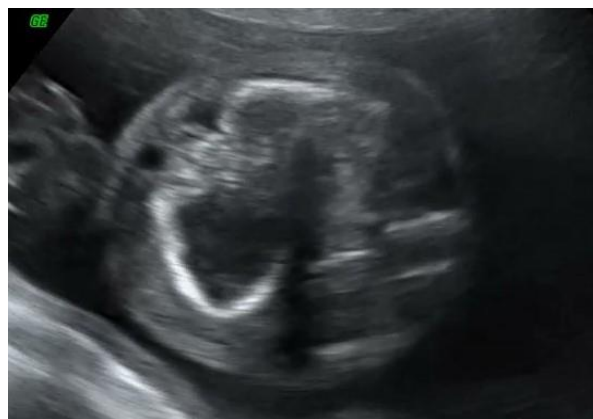
Figure 1. An axial ultrasound plan demonstrates complex abdominal mass at 22 gestational weeks

without acid formation (Figure 2). The fetal wellbeing was reassuring during the antenatal period. At 39 weeks of gestation, a 3,670 gr male infant was delivered spontaneously. The postnatal course was uncomplicated and the abdominal examination was normal. The newborn's initial laboratory data revealed mild anemia (Hb 9.7 g/dl). The thrombocyte count, liver enzymes, and coagulation parameters were normal. Breastfeeding was warranted after defecation of the newborn. The ultrasound examination revealed a 20x22 mm hypo-echogenic cystic mass in the right upper abdomen which had acoustic shadowing in the posterior wall due to calcifications (Figure 3). Also, numerous calcification foci existed around Morrison pouch (Figure 4). The diagnosis of meconium peritonitis was confirmed, and clinical observation was considered. Abdominal distension or vomiting were not observed in the postnatal period. A sweat chloride test was performed, and cystic fibrosis was excluded. The neonate was discharged four days after birth. The abdominal cystic mass and calcifications resolved spontaneously at three months of life.