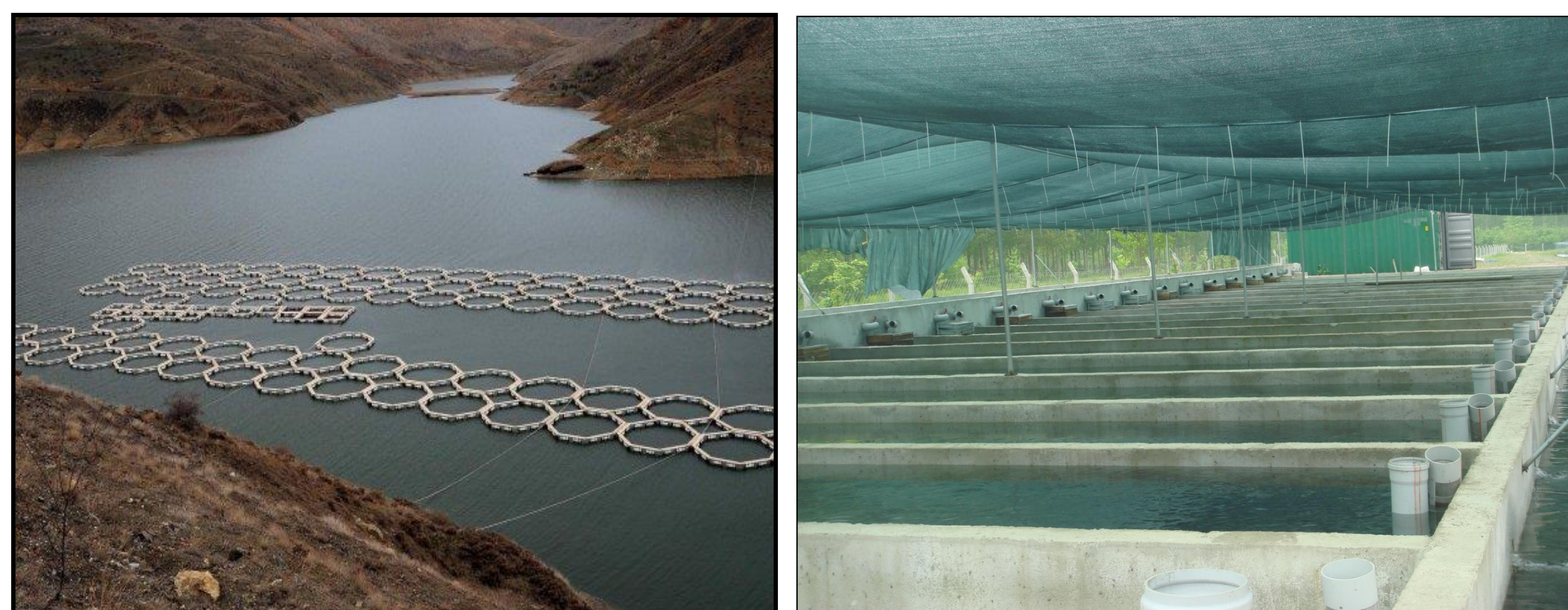
General view of Turkey's trout aquaculture farms.