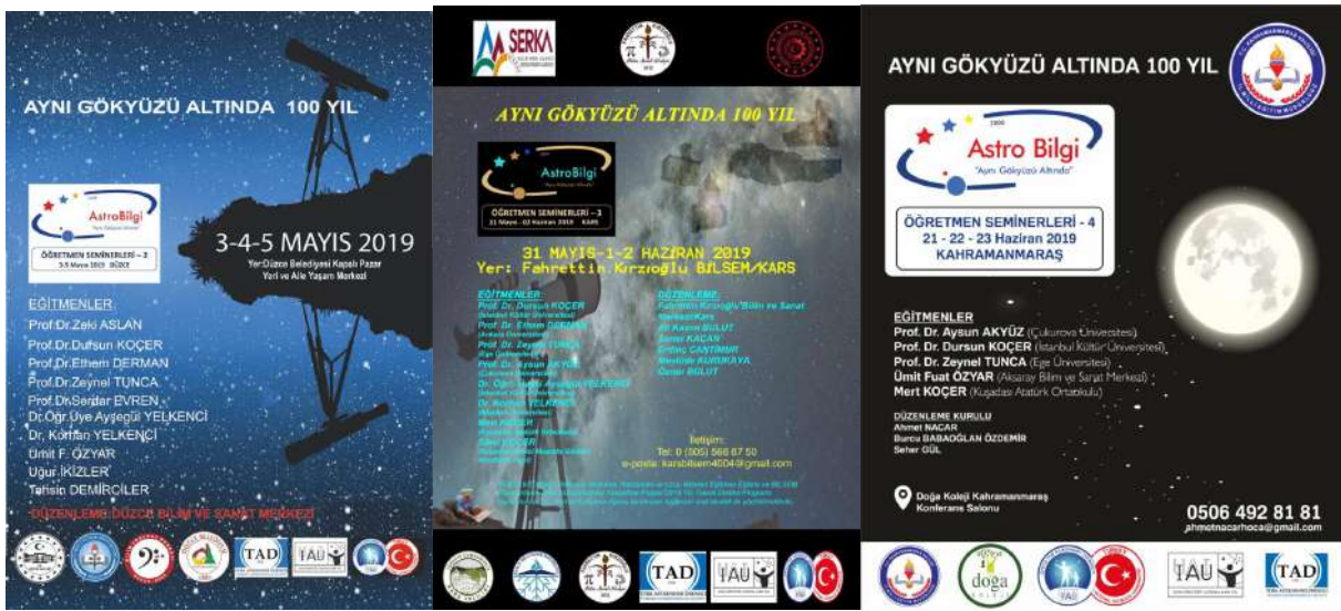
Figure 7: Sample teacher training events that have been organized by AstroBilgi, Turkish Astronomical Society’s Public Outreach Commission. Examples here for the events in the cities Düzce, Kars, and Kahramanmaraş, respectively.