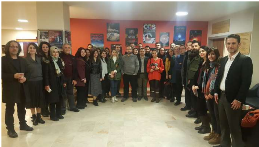
Figure 8: Teacher training program organized by Istanbul Branch of Ministry of Education together with Istanbul University, Department of Astronomy and Space Sciences.