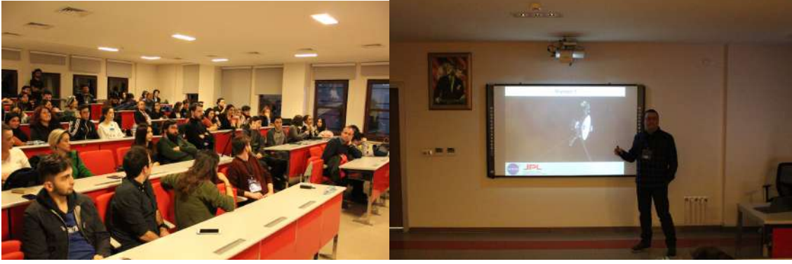
Figure 6: Photos from the Pale Blue Dot event in Istanbul University.