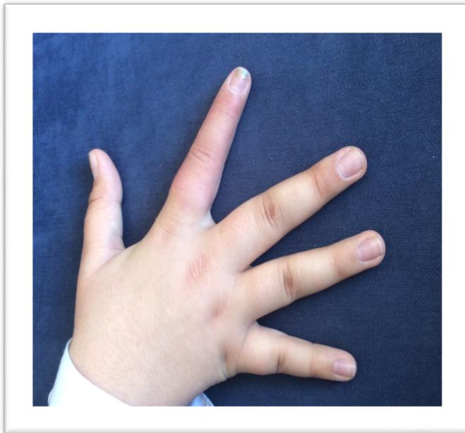
Figure 6. The wound healed without sequela after the treatment