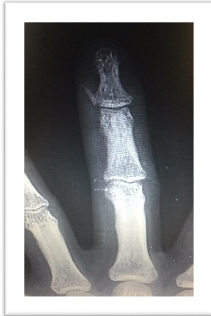
Figure 2. Radiologic imaging of the left hand of the patient. The spine of fish was embedded in the soft tissue close to the distal interphalangeal joint.