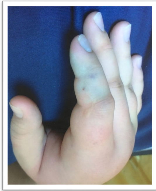
Figure 3. Sting site by lionfish. Puncture wound with local cyanosis, ecchymosis at the dorsum of the index finger after envenomation