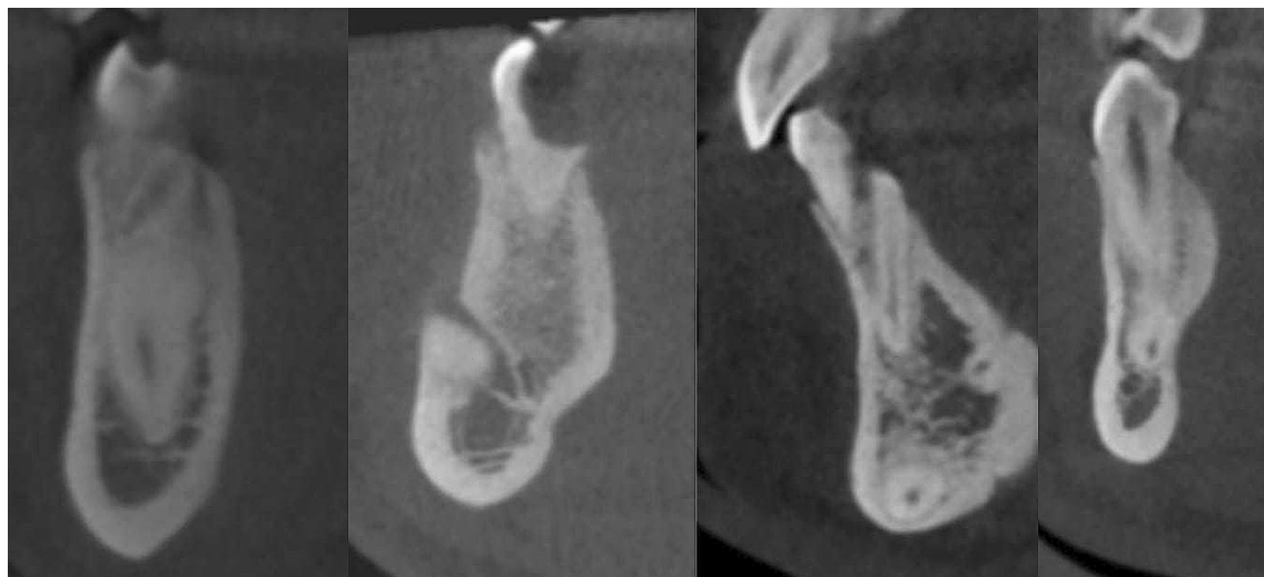
Fig. 1 Mandibular cortical bone and impacted canine's apex relation: a There is no contact between two structures. b The impacted canine is in contact with mandibular labial cortical plate. c The impacted

canine is in contact with mandibular cortical plate's basal. d The impacted canine is in contact with mandibular lingual cortical plate